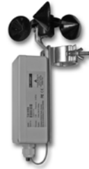
BW-WSS Anemometer Wireless wind speed sensor