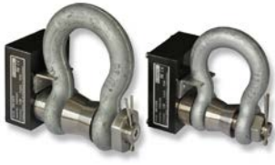
BW-S325 & BW-S475 Shackles BroadWeigh wireless 3 ¼ ton and 4 ¾ ton Crosby Safety Bow Shackles