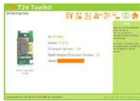
BW-Toolkit Software used to calibrate and configure your devices