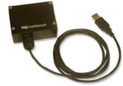
BW-BSue Extended range wireless radio telemetry USB Base Station