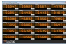
BW-LOG100 Data logging software package for advanced monitoring up to 100 channels